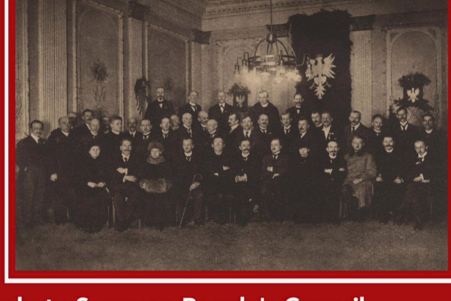
photo Supreme People's Council

The election during the Polish District Sejm [3–5 December 1918] of own representation in the form of the SUPREME PEOPLE'S COUNCIL and its COMMISSION – the main body of the Polish authorities on the Polish territory of the Prussian partition