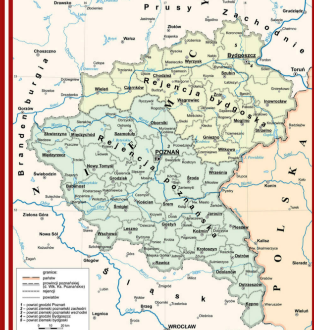
Map of the Poznań Province (by Radosław Przebitkowski of: pw.ipn.gov.pl)