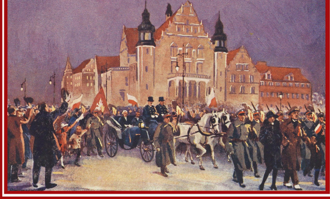
photo Arrival of Ignacy Jan Paderewski to the centre of Poznań, 26th December 1918. (reproduction of a watercolour postcard by Leon Prauziński from the POLONA collection)

The arrival of Ignacy Jan Paderewski in Poznań