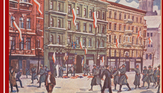
photo Tearing Polish and allied flags by German soldiers (reproduction of a watercolour postcard by Leon Prauziński)