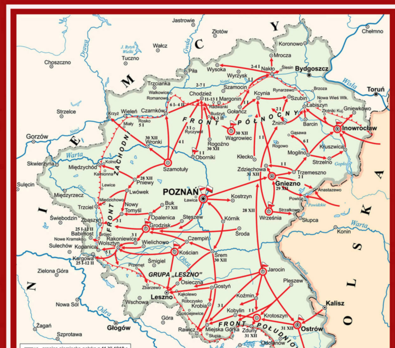
Map showing the spread of the uprising (author Radosław Przebitkowski from: pw.ipn.gov.pl)

The insurgents took control of almost whole Poznań Province