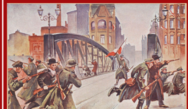
photo Fights at the Chwaliszewski Bridge in Poznań, 27 XII 1918 (reproduction of a watercolour postcard by Leon Prauziński)