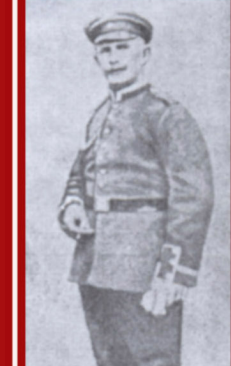
photo Franciszek Ratajczak (1887–1918) Often regarded as the first casualty in the uprising.