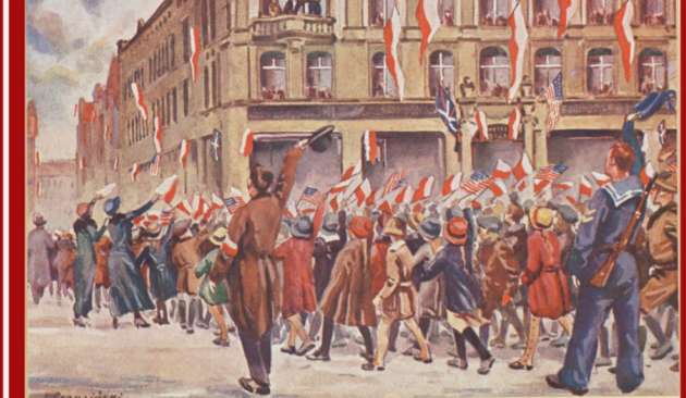
photo Manifestation of Polish children in front of the Bazaar hotel (reproduction of a watercolour postcard by Leon Prauziński from the POLONA collection)

German Counter-Manifestation with German soldiers from the 6th Regiment of Grenadiers