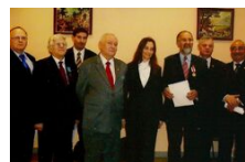
Leaders of the Society for the Memory of the Greater Poland