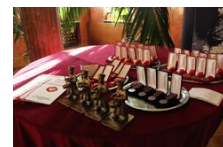
In the first row "Drummers" ...